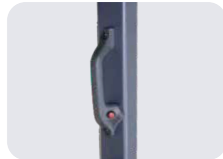
Rear hand holder with horn function (Optional)