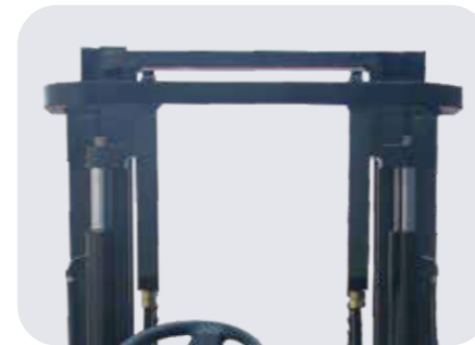
Excellent visibility thanks to optimized