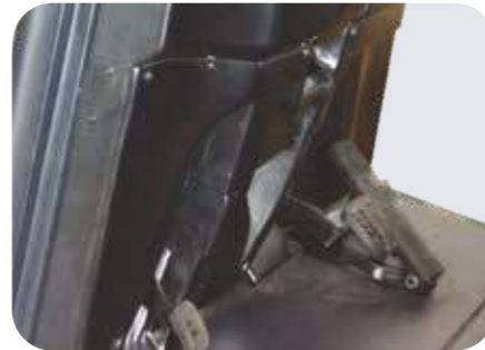
Foot-type parking brake system