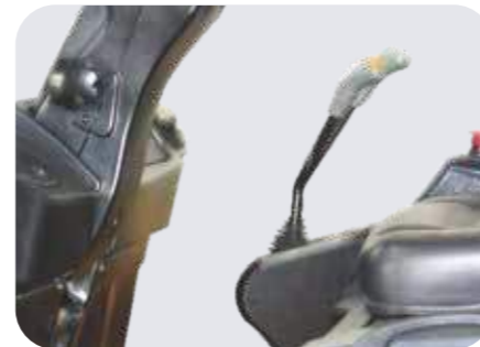
Hydraulic operating handle on the right side