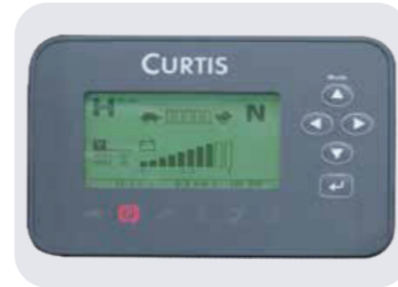
Big LED display