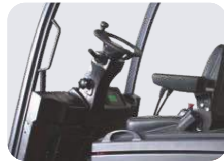
Excellent ergonomic design